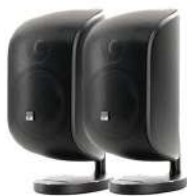
M1 RearSpeaker 20W - 100W into 8Ω