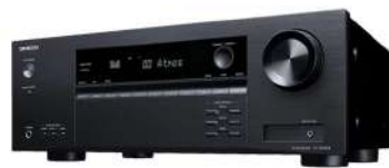
TX-SR494 7.2Ch Receiver 80 W/Ch into 8Ω