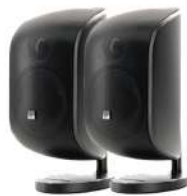
M1 RearSpeaker 20W - 100W into 8Ω