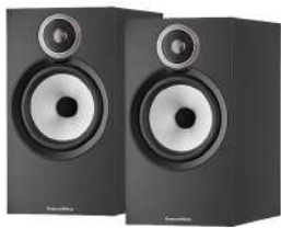
606 S3 Bookshelf Speaker 30W - 120W into 8Ω