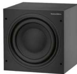
ASW610 Subwoofer 200-watt