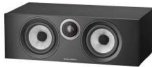
HTM6 S3 CenterSpeaker 30W - 120W into 8Ω