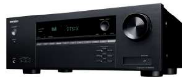
TX-NR5100 7.2Ch Receiver 80 W/Ch into 8Ω