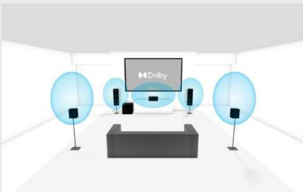
PERSPECTIVE DETAIL FOR 5.1 SETUP

This number refers to how many powered subwoofers you can connect to your receiver.